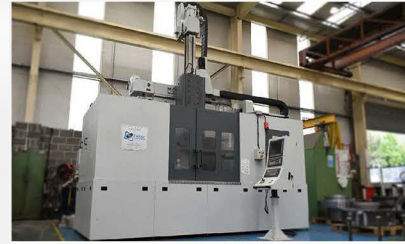
MORANDO VLN 12