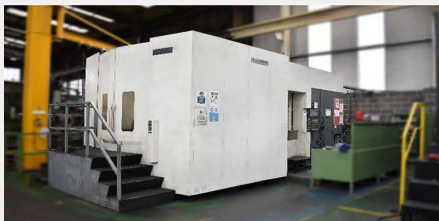
KITAMURA MYCENTRE HXS00XI